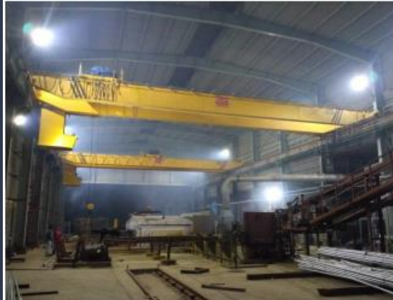
Customer: SURYA Roshni Limited, Hindupur 5Ton Double Box Girder EOT Crane