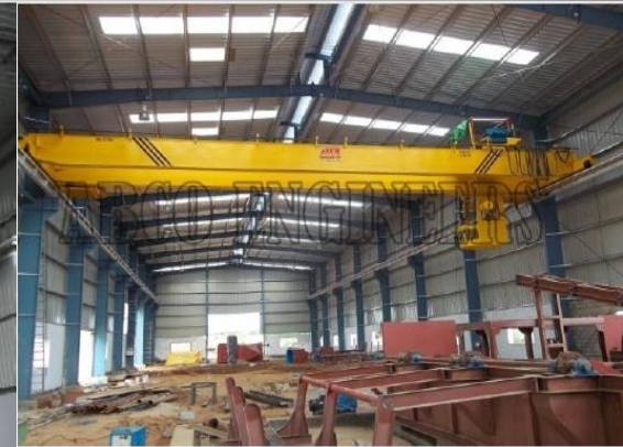
Customer: APL APOLLO Tubes Pvt. Ltd. Hosur 10 Ton Double Box Girder EOT Crane