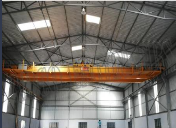
Customer: RamKorp Steel Tech Pvt. Ltd. Bangalore 10 Ton Double Girder EOT Crane