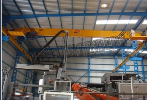
Customer: Olare Hydraulics India Pvt. Ltd 3 Ton Single Box Girder EOT Crane