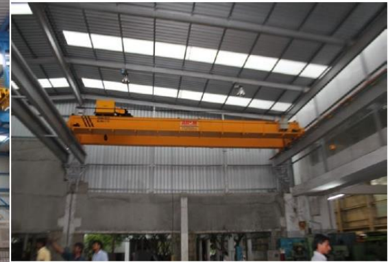
Customer: Prabha Industries . Bangalore 7.5/3T Double Box Girder EOT Crane. (In Association with THAC, Taiwan)