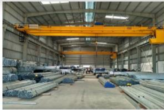
Customer: SURYA Roshni Limited, Hindupur 5 Ton Double Box Girder EOT Crane