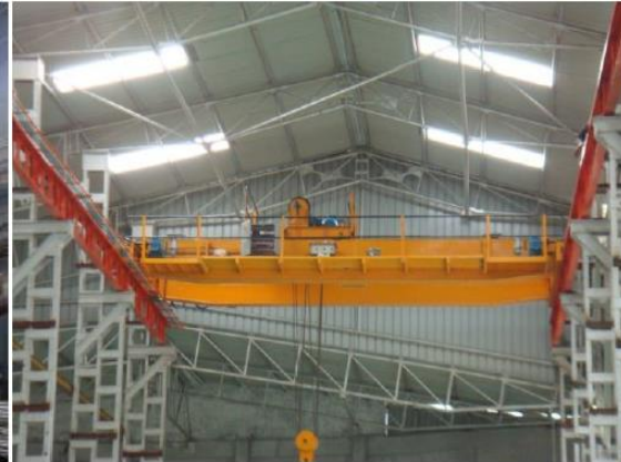
Customer: Universal Power Transformers, Haridwar 20Ton Double Box Girder EOT Crane. (